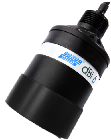
dB i 6 Profibus PA Transducer with Submergence Shield.

dB i Profibus PA Transducers operate on the principle of timing and the echo received from a measured pulse of sound transmitted in air and utilize state of the art echo extraction technology.