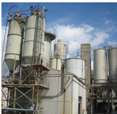
An example of silo level measurement.