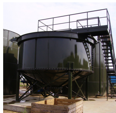
Liquid Tank Level Monitoring