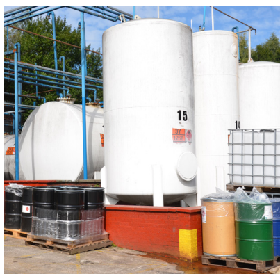
An example of tank level measurement.